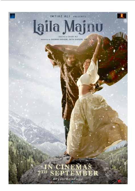
Laila Majnu released 7<sup>th</sup> Sep